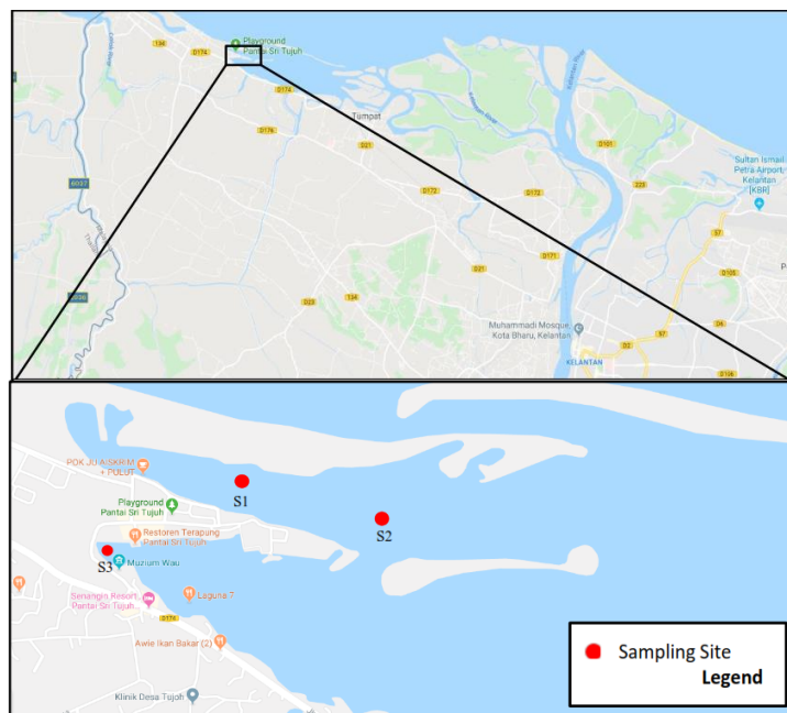
Figure 1. Three sampling points at Sri Tujuh Beach, Tumpat