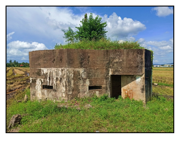
FIGURE 1. Pillox located in the middle of paddy field at sub-district of Gelung, Kubang Pasu District of Kota Setar

Kubang Pasu district is the border district between Kedah Darul Aman and Perlis Indera Kayangan. Based on the field study conducted, a total of six pillboxes have been successfully discovered in this district which is located in the districts of Pering, Gelong and Bukit Tinggi. In Pering sub -district, two pillboxes were discovered in Kampung Bukit Kalong. This pillbox is located at the foothill of Bukit Kalong and there are few local community houses located around the pillbox. Based on the location of the pillbox which is located close to the KTMB Kodiang station, we can understand the purpose of the pillbox built in this area is to defend the station from enemy attacks. Mukim Gelong, Kubang Pasu has four pillboxes. One is located at Lorong Lebai Bakar in a land owned by a villager while the other three are located near the paddy fields. Interestingly, the design of the pillbox in this sub-district is very different from other pillboxes in Malaysia and can only be found in the Gelong sub-district, Kedah. The other two pillboxes that were discovered in the Kubang Pasu district are located in the Bukit Tinggi sub -district. The first pillbox is located in the private land of a villager at Lorong Idaman 7/2 and the other is located at Lorong Idaman 8.