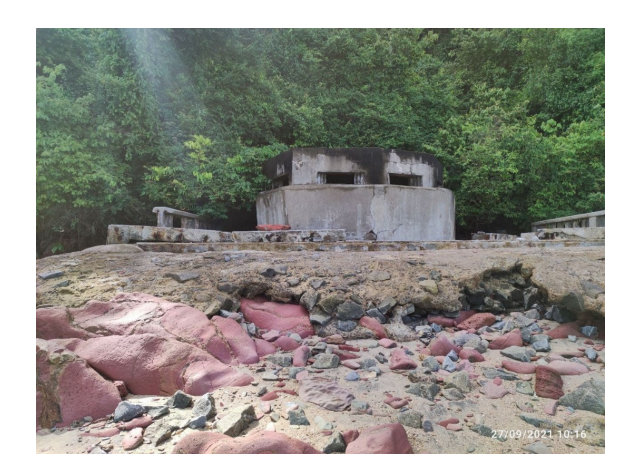
FIGURE 3. Pillbox at Pantai Merdeka, the only pillbox located on the costal area

Kedah has only one pillbox which located right on the coastal area, which is at Pantai Merdeka. It is found that a concrete fence has been built around the pillbox with a plaque put on the pillbox facade. Currently, this pillbox is located within the area of Jerai Geopark. The final pillbox in Kuala Muda is located in the Kota subdistrict or more precisely behind the Kuala Muda post office. Nowadays this pillbox is located right in front of a food stall. The following is a table showing the Distribution of Pillboxes in Kedah by District;