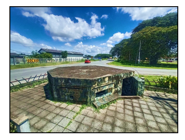
FIGURE 2. Pillbox located on the intersection of Bukit Pinang

Along the Hutan Kampung road there are three pillboxes located on the side of the road. The first location of pillbox, it is located in front of the KTU Officer's Family House or also known as KM 8, Jalan Hutan Kampung by some people. There is one significant feature of the pillbox here which is the existance of internal dividing wall inside the pillbox. It is therefore denying the general assumption of some pillbox researcher in the country who stated that there has no such typology of the pillbox in Kedah. For the second pillbox, it is located near the office of the Bukit Pinang Sub -District Head/Hutan Kampung and is located near to the paddy fields. The last location where pillbox has discovered is along Hutan Kampung road which near to a used car shop. Its location is also known as KM 10, Jalan Hutan Kampung. Meanwhile, in Kampung Bohor, there are two other pillboxes located on the private land. One is located next to the villagers' houses and the other in the middle of a paddy field.