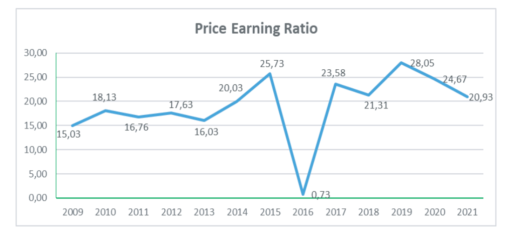
Figure 2: Price Earnings Ratio (PER).

a decrease in book value per share because one of the cement companies had a low equity book value. Low equity is caused by, first; the company suffers a loss, second; there is an element of equity change that increases the retained earnings that have not been determined (retained earnings unappropriated). Retained earnings reflects that the company has fund which is ready to be used for business activities, or commonly known as reserve fund. However, if the balance of undetermined profit is higher than the profit that has been determined, the company cannot use undetermined equity to generate optimal profits. This condition provides information (as bad news) for investors which will impact on their investment decisions. In the event of a lack of purchase of the shares, it will not increase the value the price of shares in market. Until 2021, PBV experienced a decrease due to the high allocation of retained earnings unappropriated. Retained earnings, in which the use are not determined yet, is usually distributed to shareholders as dividends. The retained earning that has been determined to be used will be low so