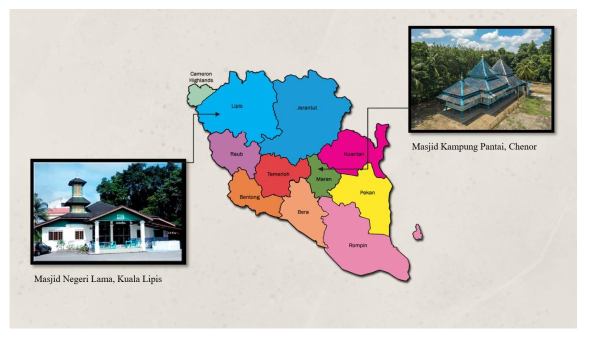
Figure 1: The Location of Masjid Negeri Lama Kuala Lipis And Masjid Kampung Pantai, Chenor