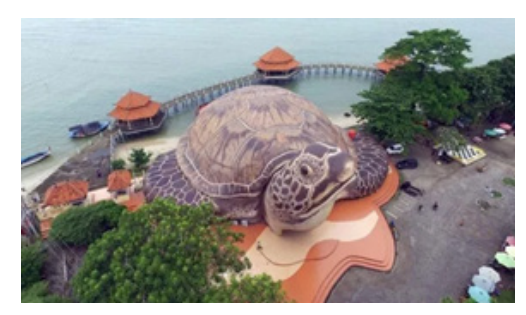
Figure 2. Giant turtle building on Kartini Beach, Jepara

partemen Kehutanan, 2004). Apart from turtle breeding, one of the coastal tourist destinations, Kartini Beach, has a giant turtle-shaped building regarded as an icon in the Jepara regency, as shown in Figure 2 (Surojo & Wicaksono, 2019). This building consists of 2 floors. The lower part is a park containing various marine life, including turtles, while the upper serves as a supporting vehicle.