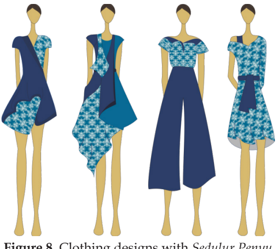
Figure 8. Clothing designs with Sedulur Penyu motifs

The fabric motif shown in Figure 7 comprises three elements depicting the iconic Jepara: the Turtle (Main motif), Jepara Carving, and the sea waves. The process of selecting objects that visualize this city is to study those typical of Jepara. The Jepara carvings are depicted on the motif of the sedulur penyu due to the identity of Jepara as the city of carving. The representation of the Jepara carving motifs is simplified to adjust with the woven cloth but still refers to the wooden carvings' base motifs. The third element in the motif is the ocean waves. The waves are associated with the existence of beaches in Jepara.