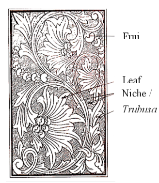
Figure 4. Jepara carving motif

Jepara carving products are widely known at home and abroad and are regarded as an export commodity for generating income (Nangoy & Sofiana, 2013). "The Word Carving Center" is Jepara's nickname for "a carving city," and a lot of people are pursuing a profession in the carving or furniture sector (Gustami, 2000). Jepara carvings are evident in numerous buildings, such as the hall, the great mosque of Jepara, the gate, etc. Furthermore, this object is used as the motif of the Troso Sedulur Penyu weaving cloth, which visualizes the icon and uniqueness of Jepara. The carvings have distinctive features like broad, fan-like leaves, narrow niches, and fruits, as shown in Figure 4. These three characteristics differentiate Jepara's carvings from other regions. They are also applied and designed as motifs to show that the fabric visualizes the potential of Jepara.