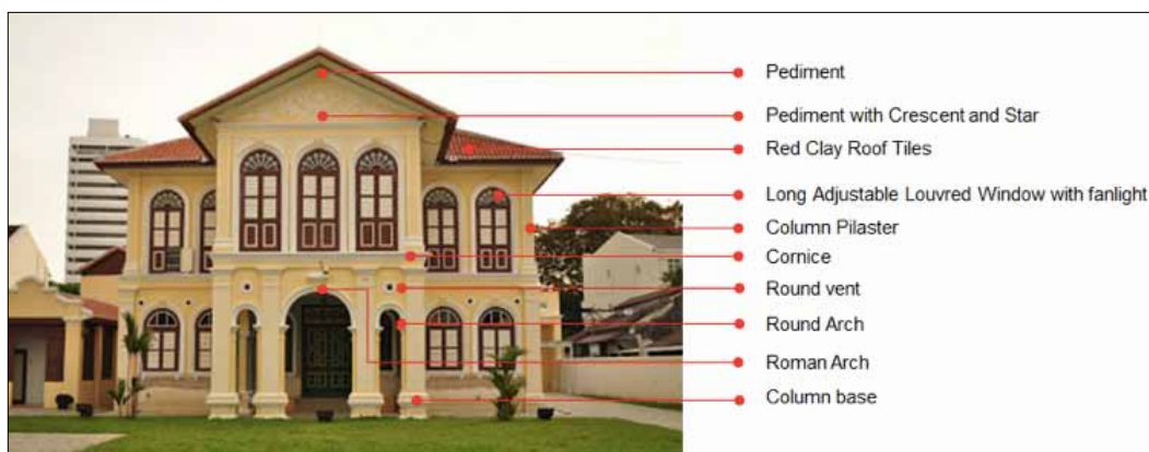
Figure 2. The Teh Bunga Mansion facade with identified features of architectural elements.

The Teh Bunga Mansion was occupied by several generations of a Chinese family until it was bought over by the Jabatan Warisan Negara (National Heritage Department). Conservation work on the mansion began in 2007, over a good 18 months, and at a cost of around RM2 million. The work included replacing parts that have been damaged and strengthening the structure. As far as possible, the original tiles are retained.