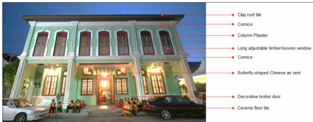
Figure 3. Pinang Peranakan Mansion facade with identified features of architectural elements (Source: Authors).