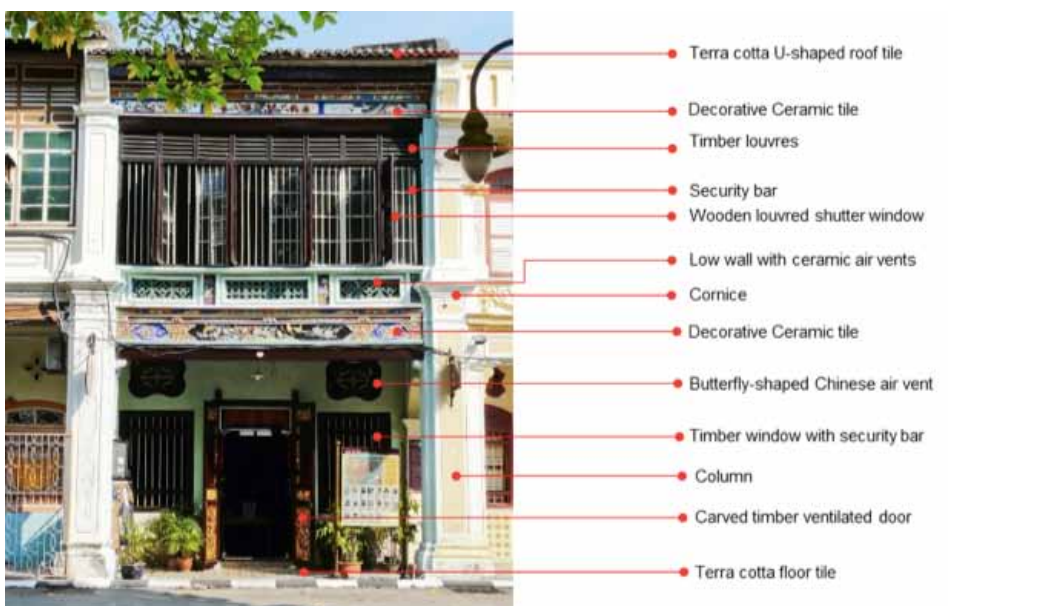
Figure 4. Sun Yat Museum facade with identified features of architectural elements.

This building underwent a few renovations and restoration work in 1993 and completed in 1994. At present, only the ground floor is accessible to the public to be used as Dr. Sun Yat Sen’s Museum, where an exhibition on the memorabilia of Dr. Sun Yat’s accomplishments is shown along with the photograph past owners of the townhouse. The first floor is now converted as a hostel for travellers (Jasme et al., 2014). The ongoing renovation of the upper floors of the building into the research centre has been carried out currently.