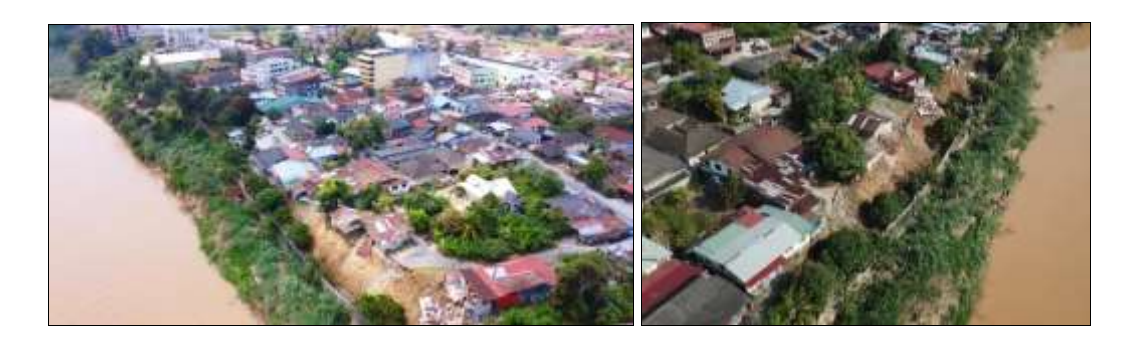
Figure 4.0: The landslides impact on February 2021

Boats were used before the Salor Bridge was completed. The Salor Bridge has been constructed to replace the water transportation system, making the boat terminal is no longer visible. The market is at the base of a square area surrounding by traditional timber settlements and shophouses. It is open 6.30 a.m to 11 a.m (Figure 5.0). The majority of sales are of daily necessities such as fruits, vegetables, fish, and others by Malay traders who were persistent and hardworking. This market becomes an attraction for locals eager to purchase 'ikan pekasam budu,' a traditional dish during the monsoon season.