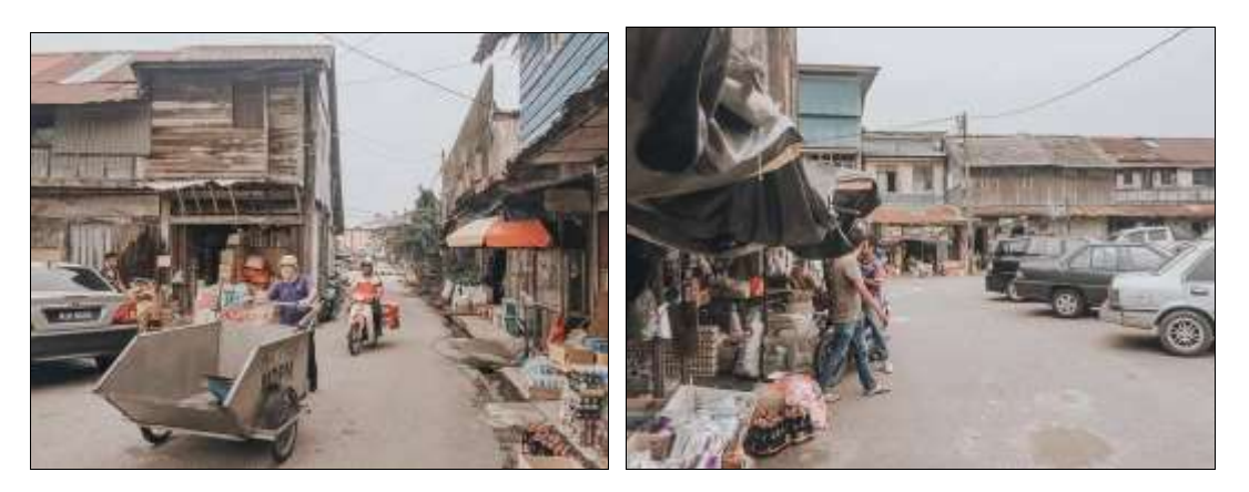
Figure 5.0: Pasir Mas Old Market activity before landslides disaster

Boats were used before the Salor Bridge was completed. The Salor Bridge has been constructed to replace the water transportation system, making the boat terminal is no longer visible. The market is at the base of a square area surrounding by traditional timber settlements and shophouses. It is open 6.30 a.m to 11 a.m (Figure 5.0). The majority of sales are of daily necessities such as fruits, vegetables, fish, and others by Malay traders who were persistent and hardworking. This market becomes an attraction for locals eager to purchase 'ikan pekasam budu,' a traditional dish during the monsoon season.