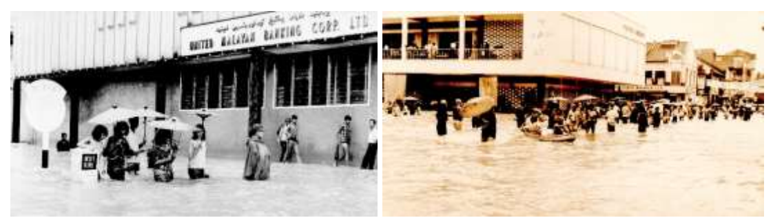
Figure 1.0. Red Flood in Kelantan during 1967

The Yellow Flood brought down much of Kelantan's infrastructure. It is believed to be the most catastrophic flood in Kelantan's and perhaps Malaysia. Many other issues have arisen from the flood's impacts, including power outages, food insecurity, property destruction, settlements, infrastructure loss, and land loss along the river's fringe (Md. Akhir & Azman, 2018).