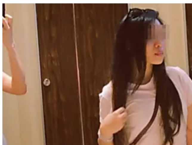
Former Miss Universe Malaysia refuses to wear 'face diaper' unless necessary | New Straits Times