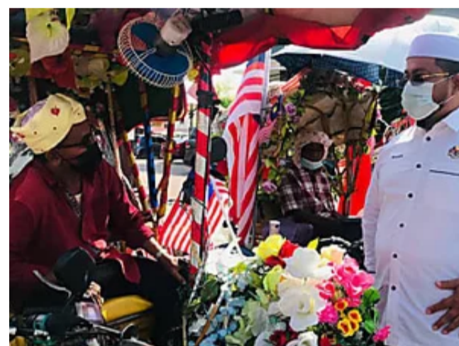
VIP who jumped queue at mosque for Friday prayers to be probed | New Straits Times