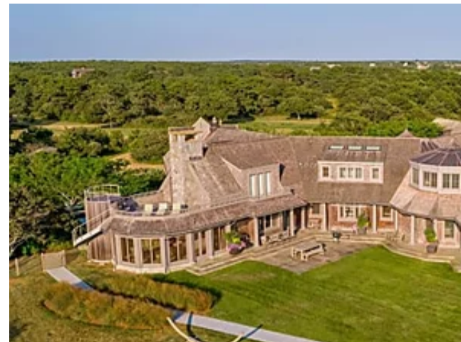
A Guide To Barack and Michelle Obama's $11.75 Million Martha's Vineyard Estate