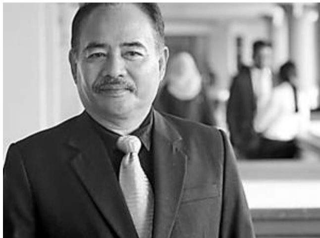
'Sultan of Melaka' dies of Covid-19 | New Straits Times