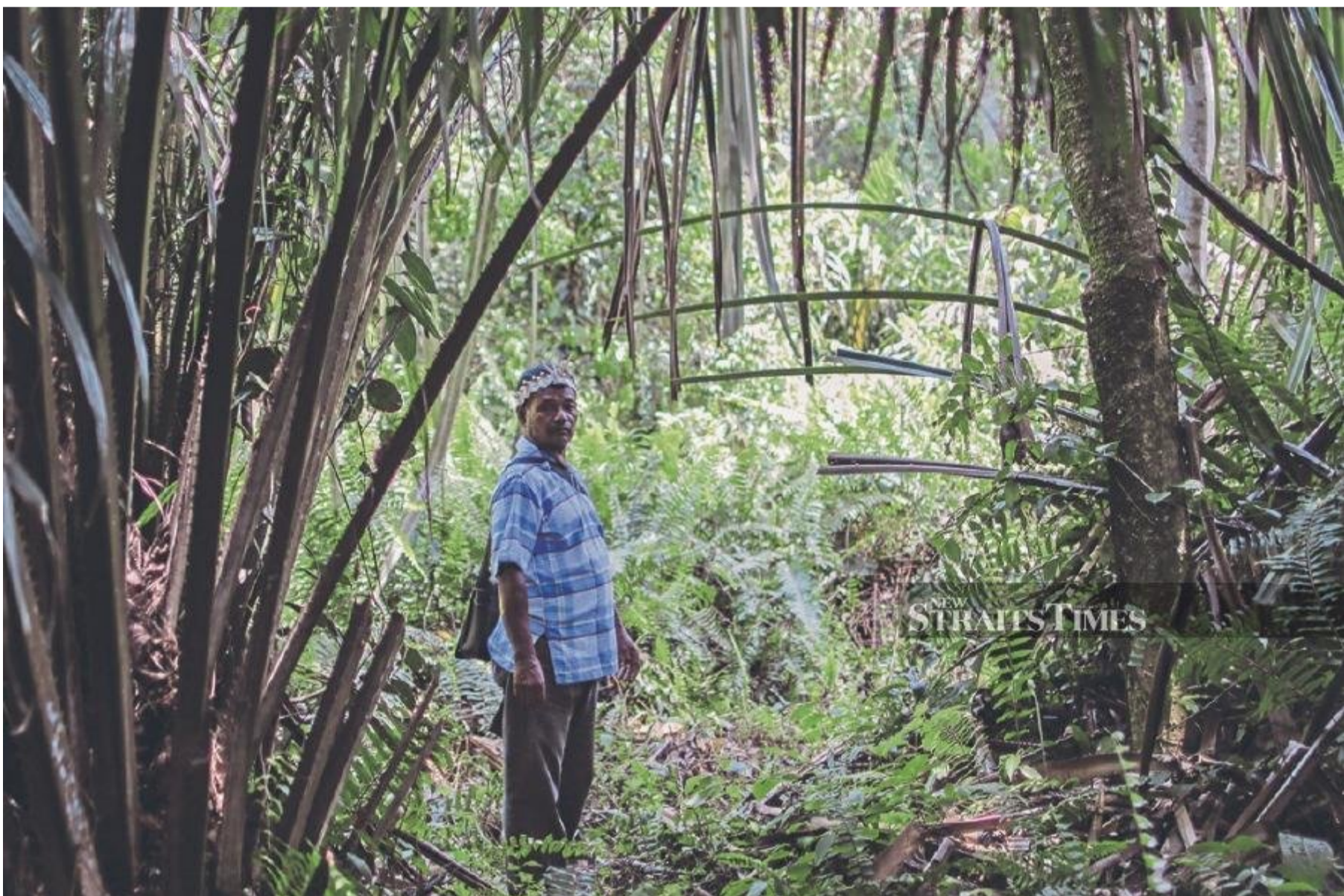
Forests are key sources of income and food for the indigenous people.

LETTERS: Thanks to technological advancements, Google satellites have supplied us with clear images of what's happening in the deepest parts of our forests.