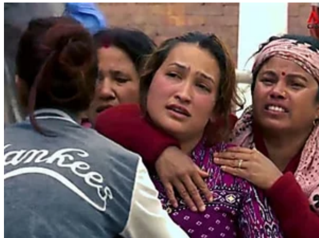
Nepal is struggling to recover after the earthquake in 2015, will COVID19 pose a new challenge?