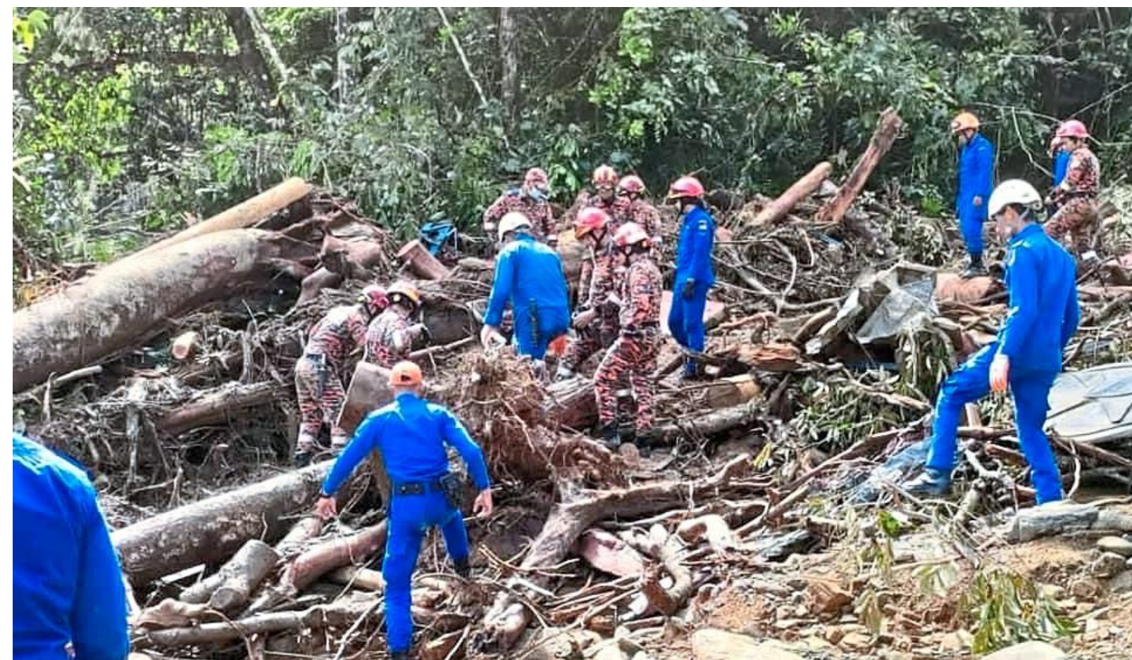
Disaster: Civil Defence Force personnel searching for missing villagers at the landslide site in Yan on Aug 21.

EVEN if people don't know much about global warming and the climate crisis, just reading the news every day is enough to tell us that what is happening nowadays is massively damaging on a global scale. Deadly fires in Turkey, severe floods in India and China, the earthquake in Haiti – it all makes our hearts ache. Malaysia is not exempt either: a landslide earlier this month in Yan, Kedah, triggered by heavy rains, killed at least four people and caused hundreds and thousands of ringgit in property damage.