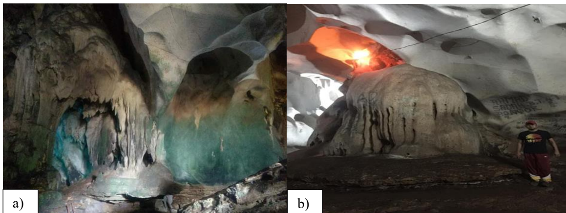
Figure 2: a) The common structures in any caves, stalagmite and stalactite and, b) travertine that formed from calcium carbonate precipitation.

3.2.1 Scientific/ educational values. Scientific or educational values usually referring to any geological features, landforms, mineral contents, fossils and anything that scientifically resemble the process or geological history of certain area. On the other hand, these values can be used to educate, not only the professionals or academicians, but the locals itself. In the study area, the basic structures that can be observed in most of caves which are stalactite and stalagmite (Figure 2). These stalactites and stalagmites, were long, elongated and formed from many types of minerals deposit. A stalactite hangs at the roof or walls like an icicle, whilst a stalagmite occurs like an upside down of stalactite. The other feature in this cave is travertine where it is the secondary structure formed from the dissolution of limestones, where the calcium carbonate had been precipitated (Figure 2).