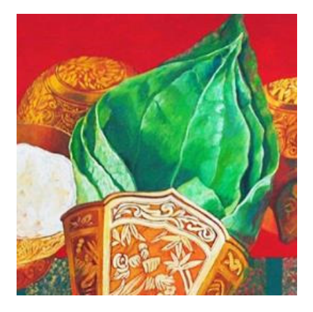
Figure 3: Din Omar, "Betel leaves Tepak Sirih series"(1995), Acrylic on canvas

uses 'chocolates' as gifts and the present-day society has undergone changes by making the delivery using popular fast food from the west such as the brand, 'KFC'. It is directly opposed to the customs of the earlier desire that emphasizes ceremonial customs especially in the proposal for a marriage and preserving customs.