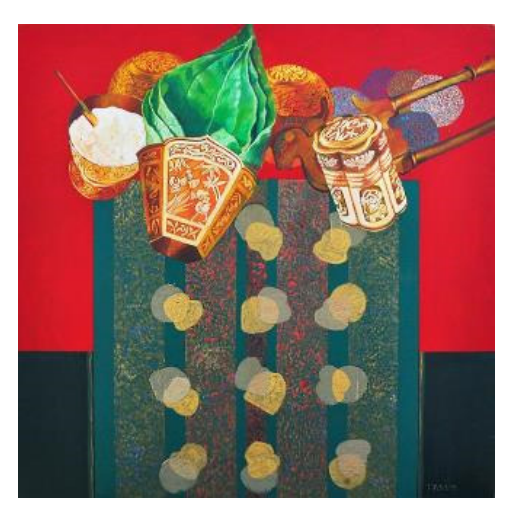
Figure 2 : Din Omar, "Tepak Sirih Series" (1995), Mixed Media on Canvas.120 x 120 cm

The picture Figure 2 above depicts the Tepak Sirih , which is a signifier symbol of Malay heritage in weddings and engagement ceremonies in Malaysia. The Tepak Sirih has an aesthetic and also semiotic values as it is customary to present it in a Malay engagement and wedding ceremony. With the cultural substance of this heritage, the Malay community presents a richness in tradition which must be inherited by the younger generation. The heritage is also related to the symbols and the Tepak Sirih represents a philosophy of customary value in the special events.