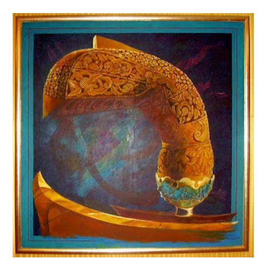
Figure 5: Din Omar " Ukiran Indah Di Puncak Indah " (Siri Keris) (2005), Acrylic on Canvas, 60 inch x 60 inch

The use of Tepak Sirih to await the arrival of guests is also a custom where Tepak Sirih is an important item during the visiting process of the guests and the host. In the past, if a person comes to a house for the purpose of visiting, the host will invite the guest to have a taste of the sirih with buah pinang as a custom of breaking the ice. This is evident in the event of the merisik or proposal entourage, where the guests would also carry the sirih as a token and the hosts will reciprocate by leading with their own sirih . However, they would first eat the sirih together before starting a conversation or discussion, indirectly reflecting the politeness of the Malay customs and culture from a long time ago.