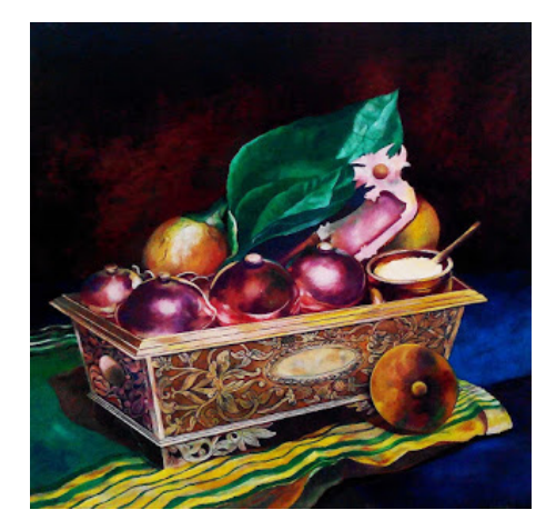
Figure 4: Din Omar" Siri Tepak Sirih; Menanti Tetamu Siri 5"(2008) Acrylic on canvas, 59 inch x 59 inch

Din Omar's painting artworks contains a sense of deep meaning in terms of signifiers of cultural materials such as the tepak sirih that has been emphasised in the series named " Siri Tepak Sirih . Menanti Tetamu Siri 5" (2008) (Figure 4). The use of Tepak Sirih was widely practised by the people in Malaya. However, in the present situation, the maintenance of the Tepak Sirih becomes costly as it is difficult to preserve its cleanliness and shine.