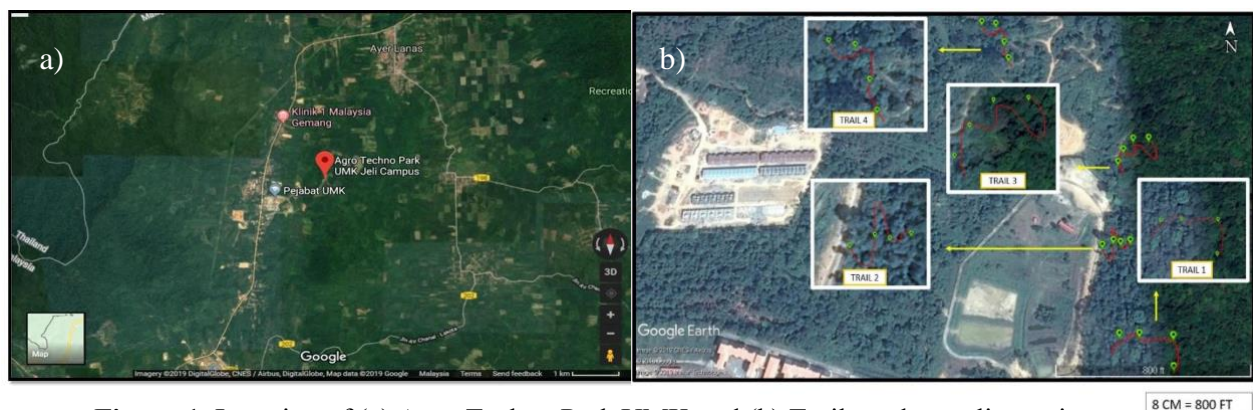
Figure 1. Location of (a) Agro Techno Park UMK and (b) Trails and sampling points.

This study was conducted at Agro Techno Park Universiti Malaysia Kelantan, Jeli Campus with latitude 5.7503112 and longitudes 101.8435386 (Figure 1). The Agro Techno Park is surrounded by intact fragments of secondary tropical forest dedicated for studies and conservation of natural resources of flora and fauna.