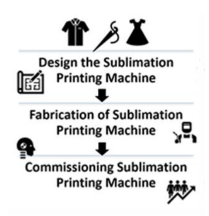
Figure 2. Flow process of fabrication of sublimation printing machine

After accomplishing the installation process, the mechanical part was embedded with the automatic processor micro system to control printer speed as required. The last section of the manufactured were field testing in industry and product commissioning. Indeed, the field tests purposely to update the settings of parameters and components in the printer speed control system to ensure the efficiency of the printer machine runs smoothly. While test acceptance of printing machines the training to staff in the company also being provided.