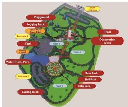
Figure 1: Map of Taman Perbandaran Tengku Anis

In order to achieve the objectives of this research, a case study has been done in a public park in Kota Bharu, named as Taman Perbandaran Tengku Anis (TPTA). Figure 1 shows the map of TPTA itself. This Public Park was built in 2004 within 7.422 hectares 2 space. 50 questionnaires had been conducted to the visitors focusing the age of youth; (see Figure 2) 15 years old to 40 years old according to the Ministry of Youth and Sports Malaysia. There was 48 questionnaires were accepted to analyse (34 male and 14 female). The result from the survey was analysed using SPSS 21 in reaching the reliability and factor analysis. The results from the Semantic Differential Methodology will show the clustered feelings of the youth towards the utilization this public park. The relationship between the physical environment and their feelings is discussed further.