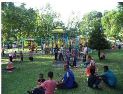
Figure 3: Visitors Activities at The Playground

The first significant finding about this paper is elaborated by the exploratory factor analysis based on eigenvalue cut off resulting four factors explained attraction in Taman Perbandaran Tengku Anis one of them is show on Figure 4, Aerobic exercise at the court with a total cumulative 72.324%. The results of the principal components analysis are presented by the physical environment, human activity and also the connection between them. The interpretation of these factors resulted as such dimension; Component 1 (29.801%), Component 2 (20.985%), Component 3 (13.505%) and Component 4 (8.032%). There is huge engagement of the third sphere (the connection between them) in this Public Park as the visitors offered plenty of activities within this Public Park.