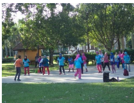
Figure 4: Aerobic Exercise at The Court

The first significant finding about this paper is elaborated by the exploratory factor analysis based on eigenvalue cut off resulting four factors explained attraction in Taman Perbandaran Tengku Anis one of them is show on Figure 4, Aerobic exercise at the court with a total cumulative 72.324%. The results of the principal components analysis are presented by the physical environment, human activity and also the connection between them. The interpretation of these factors resulted as such dimension; Component 1 (29.801%), Component 2 (20.985%), Component 3 (13.505%) and Component 4 (8.032%). There is huge engagement of the third sphere (the connection between them) in this Public Park as the visitors offered plenty of activities within this Public Park.